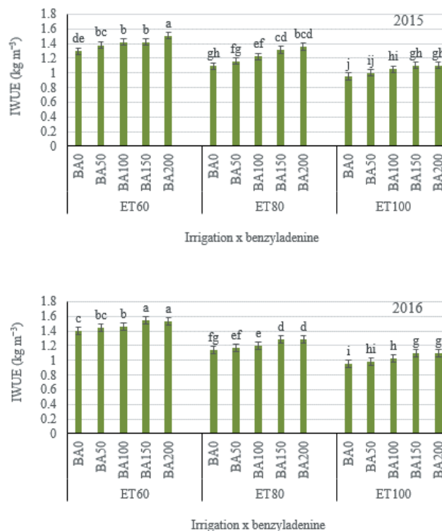
Fig. 1. Irrigation water use efficiency (IWUE) of soybean as influenced by irrigation level and benzyladenine rate. Note: ET 60 , ET 80 , and ET 100 : irrigation level at 60, 80 and 100% of crop evapotranspiration, respectively; BA 0 , BA 50 , BA 100 , BA 150 , BA 200 : benzyladenine rate of 0, 50, 100, 150 and 200 mg L -1 , respectively. Vertical bars represent means of 4 replications \pm SE ( P \leq 0.05 ). Columns marked by different letters are significantly different

the second season, while ET 100 x BA 0 or BA 50 recorded the lowest value in both seasons. Despite the similarity of benzyladenine behavior under different irrigation regimes, its relationship strength with IWUE varied (Fig. 2). In this respect, regression analysis showed that benzyladenine rate was more correlated with IWUE under low water supply (ET 60 ), since R 2 value was higher compared to other irrigation regimes (ET 80 or ET 100 ).