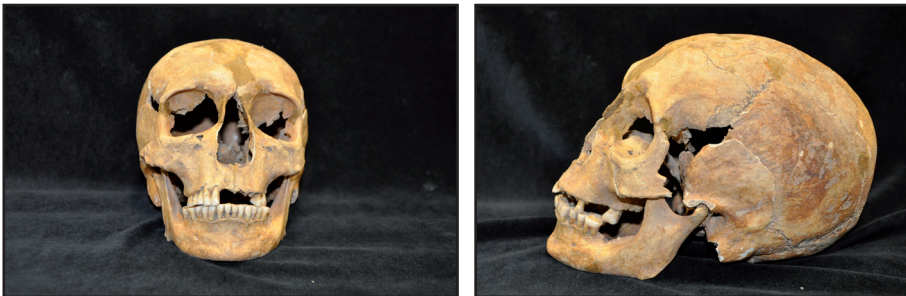
Fig. 3a-3b. Reconstructed skull from Skeleton 155 from Poulton.

In some cases, wax can help recreate missing anatomical parts, which affects the possibility of putting other portions of the same sample together. This is particularly evident during the reconstruction of skulls, where the splanchnocranium is more fragile than the cranial vault and is characterised by thinner anatomical parts, more prone to taphonomic alterations. Thus, some parts of the face (such as the nasal bones or the zygomatic processes), are recreated to improve the stability of the reconstruction. The result consists of a complete and stable skull that allows the full recording of measurements and trauma and pathology analysis (Fig. 3a and 3b).