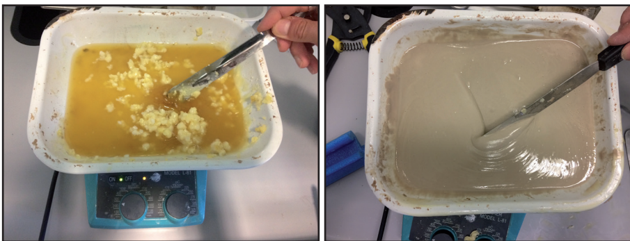
Fig. 2a-2b. Wax initial mix made with pine rosin and beeswax (a) and final compound (b).

The components are placed in a metallic tray located on a hot plate. First, beeswax and pine rosin need to be melted entirely to avoid the presence of solid residues in the mixture (Fig. 2a). After these materials formed a homogeneous blend, paraffin, casting powder and calcium carbonate are added (Fig. 2b). This admixture creates a compound suitable for reconstructing missing parts in the skull, as it is stable, reversible and does not damage the bone surface. For the best performance in the reconstruction with wax, a mix of pigments (brown iron oxide and raw sienna) can be used to recreate a natural colour. According to the purposes of the restoration, the colour of the reconstructed part can be made more distinguishable from the surrounding bones; however, it is always important that the wax part will not visually outstand, creating a bias during the visual examination of the remains.