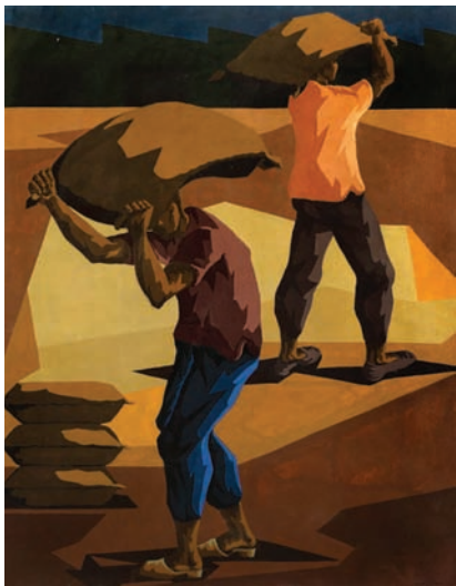
Fig. 3 - Graciano, Clóvis. Coffee harvest . n.d. 84 x 66 cm. Gouache on cardboard. Private collection.