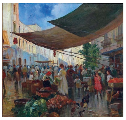
Fig. 10 - Gerardenghi, Bigio. Street fair . 1927. 35 x 39 cm. Oil on canvas. Private collection.