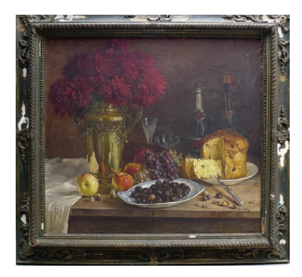
Fig. 7 - Fonzari, Antonio. Still nature . n.d. 85 x 78 cm. Oil on canvas. Private collection.

particularly difficult starts<sup>6</sup>. Many of them, graduates of Italian Art Schools, became craftsmen, artisans who worked under commission and shaped many of São Paulo's urban features through architectural projects, the building of monuments and advertising, usually bringing artistic references of the Novecento and the Return to Order . The Proletarian Artists soon became a constituent component of the second wave of Brazilian Modernism.