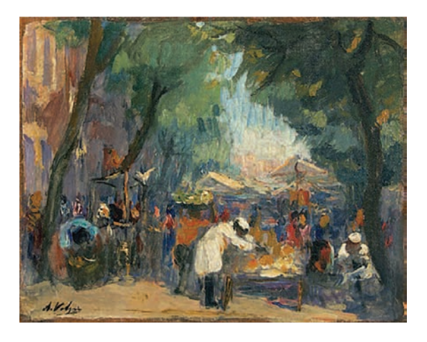
Fig. 13 - Volpi, Alfredo. Fair in Cambuci . c. 1920. 26 x 20 cm. Oil on canvas. Private collection.

elements such as the use of Tchau (Ciao) to farming techniques, eating habits are perhaps the most recognizable Italian trait in Brazilian culture, going far beyond the elements contemplated by this article, reaching wine, wheat derivatives such as pizza and pasta, nhoqui (gnocchi), cold meats and Mediterranean greeneries. The visual representation of such elements, especially in painting, trace a visual historiography that registers the mindset of colonial times through the representation of the contemporary, fragmented and anguished contemporary man, having been particularly relevant to the building of national identity in the vanguard of the modernist movement, the first and more representative subversive wave aiming at the conception of a true Brazilian identity.