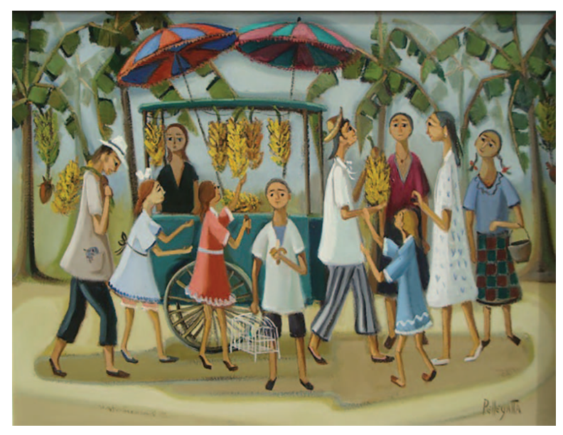
Fig. 11 - Pellegatta, Omar. Bananas salesman . n.d. 60 x 80 cm. Oil on canvas. Private collection.

«In the case of the proletarians, to register daily life [...] has the characteristic of an intimistic journal [...] looking to document their own experience. It is the humble record, based on direct observation of the life of the people of their new homeland.» (Brill, 1984, pp. 48, 49).