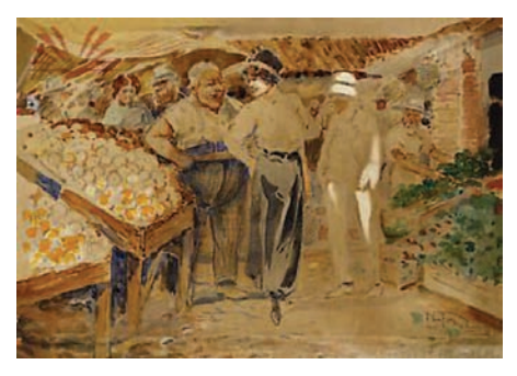
Fig. 9 - Norfini, Alfredo. Fair . 1913. 26 x 25 cm. Watercolor. Private collection.