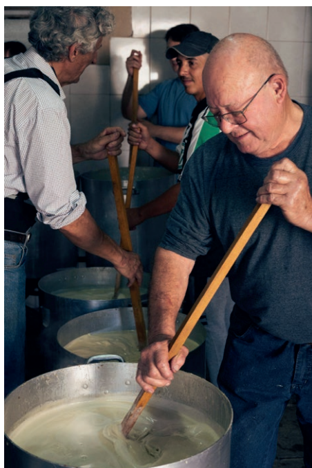
Figure 3. Preparation of bagna caoda .