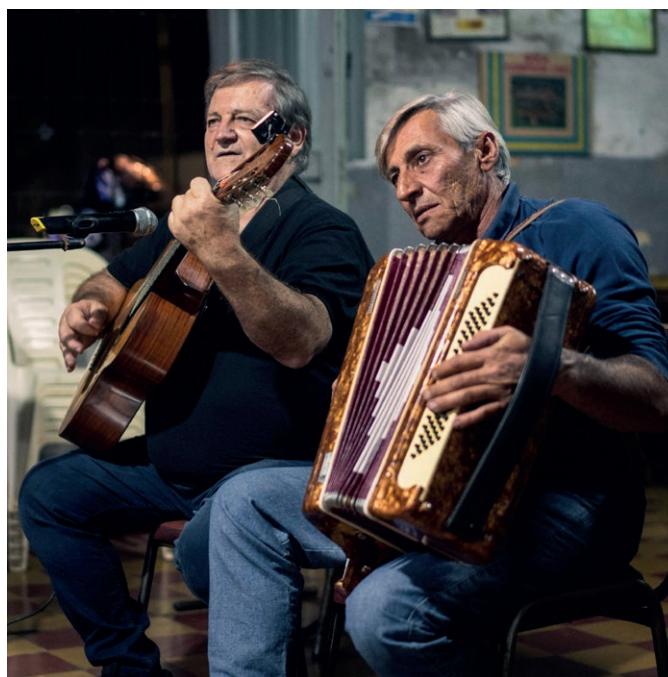
Figure 4. Music performers during a convivial gathering.

they show ‘what is going on’ when the heritage language is used: they help contextualise the observed linguistic practices and provide access to the attitudes and beliefs of the speakers. Analysis of the activities carried out by Piedmontese associations was useful, in particular, to interpret the observed practices in terms of an ongoing process of language revival.