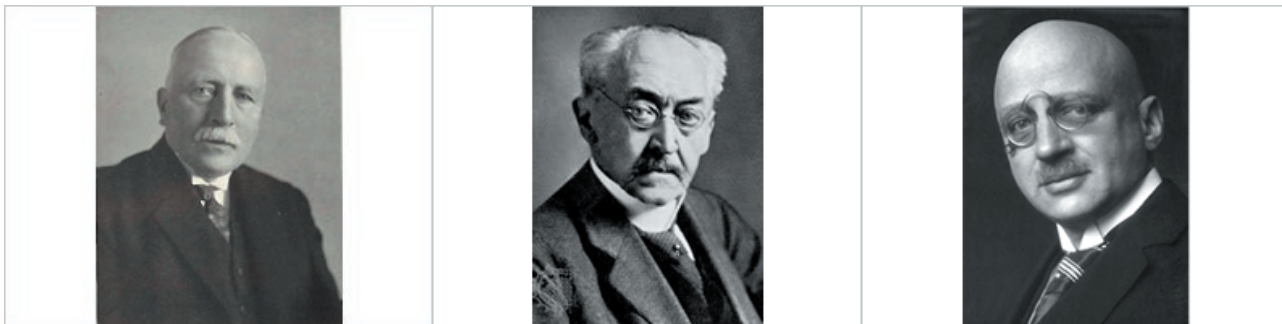
Figure 2. Left , Friedrich Schmidt-Ott, President of the Notgemeinschaft from 1920 to 1934; Middle , Adolf von Harnack; Right , Fritz Haber.

In 1920, leading representatives of science and scholarship in Germany established a working committee, which subsequently adopted the name Notgemeinschaft (“emergency foundation”). Its task was to coordinate joint action and proposals to the parliaments, governments and also potential sponsors in industry, in order to secure the provision of the necessary financial resources to continue basic research. Friedrich Schmidt-Ott, Adolf von Harnack and Fritz Haber played leading roles in this working committee, and also in lobbying the government for funding. 16, 17