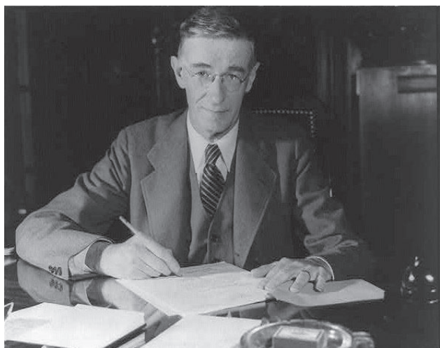
Figure 3. Vannevar Bush seated at his desk.

In 1940, prior to the US joining the War, the British revealed to the US that they had made significant strides