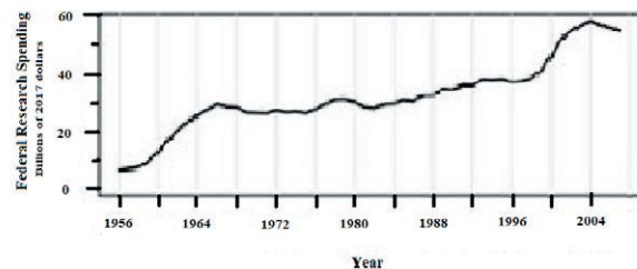
Figure 4. US Federal Government spending on research (in billions of 2017 dollars). 45

In the period up to the end of World War Two the US relied primarily upon a laissez-faire approach to scientific research and development. In 1950 President Harry S. Truman signed Public Law 507 creating the National Science Foundation (NSF), which provided for a National Science Board of twenty-four part-time members. The NSF began its first full year of operations with