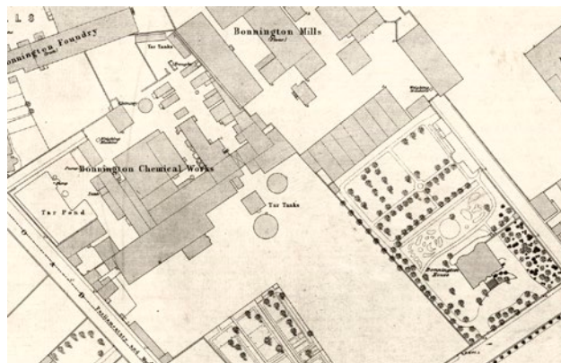
Figure 3. Bonnington chemical works near Edinburgh. Bonnington House is at the southeast corner of the overall site. Source: Ordnance Survey, Edinburgh, Sheet 16, 1876, National Library of Scotland.