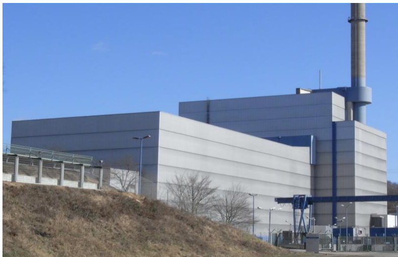
Figure 5. Picture of the Krümmel Nuclear Power Plant, which occupies the former real estate of part of Nobel's explosives empire in Germany.

300 A large remaining part of Nobel's legacy also lies in the prize, which was created in his will. Annual prizes are given out to outstanding discoveries in the fields of physics, chemistry, physiology or medicine, literature, peace, and economics. Prizes include a generous cash payment. In addition, the Nobel Prize Foundation has gained significant prestige since Alfred Nobel's passing. It is the most significant scientific honor. It is probably the most famous remaining occurrence of the namesake of Alfred Nobel. Its origin is disputed, but I believe his decision to create the prize was the result of a long-standing deliberation, and not an instantaneous knee-jerk reaction to an incorrectly written newspaper article. Without the Nobel Prize, the discoveries of Nobel may have been left in the annals of history.