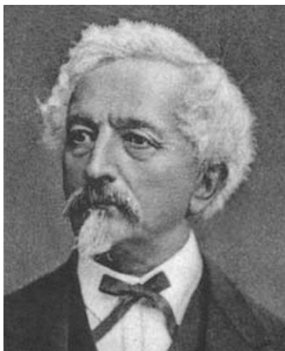
Figure 3. Portrait of Ascanio Sobrero. Image is currently in the public domain

160 Ascanio Sobrero was born in 1812 in Italy to a wealthy academic family. Figure 3 portrays Sobrero. His father was the secretary of the Royal University of Turin, and Sobrero grew up with a strong focus on academics and the sciences. In 1833, Sobrero graduated from the Royal College of Casale Monferrato with degrees in medicine and surgery. [17] For his graduate studies, Sobrero struggled to 165 choose between medicine and the hard sciences. He obtained his medical license the following year, but he was slowly convinced toward chemistry by his uncle Carlo Raffaello, a general of artillery and the director of the chemical lab of the Arsenal of Turin. Eventually, by 1845, Sobrero had decided to dedicate his talents entirely to chemistry. He accepted a job as a professor of chemistry at the University of Turin, and shortly after, he wrote the above-mentioned letter to Théophile Pelouze. [18]