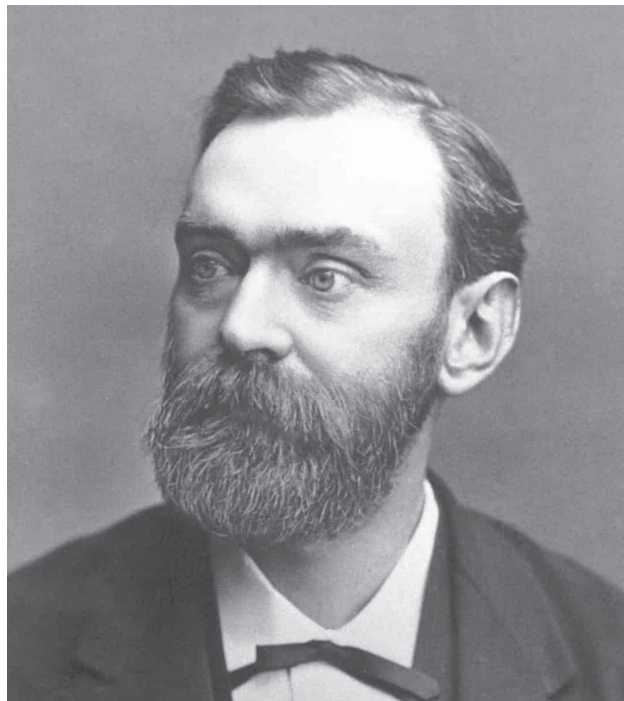
Figure 4. Portrait of Alfred Nobel.

Sobrero created nitroglycerin by stirring drops of glycerin into a cooled mixture of nitric and sulfuric acids. He initially named the substance 'pyroglycerine', and, unlike the procedures discussed for nitrocellulose, this resultant material was oily instead of solid. [13] Upon its discovery, Sobrero conducted many tests on the substance. The most famous involved heating a drop of the substance in a test tube which exploded, permanently scarring his face. Eventually, Sobrero deemed the substance too destructive and volatile for practical use. He feared the implications of the commercialization of nitroglycerin. He was quoted to have said later in a communication to the University of Turin, "When I think of all the victims killed during nitroglycerin explosions, and the terrible havoc that has been wreaked, which in all probability will continue to occur in the future, I am almost ashamed to admit to be its discoverer." [19] Initially, after discovering nitroglycerin, Sobrero kept his findings secret for over a year. Yet, with the popularity of Schönbein's research on guncotton, he knew that it would be impossible to hide forever. He released his studies on nitroglycerin in 1847. [20] Shortly after that, engineers worldwide envisioned its practical and deadly applications.