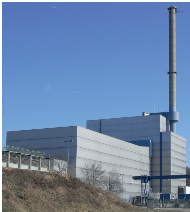
Figure 5. Picture of the Krümmel Nuclear Power Plant, which occupies the former real estate of part of Nobel's explosives empire in Germany.

A large remaining part of Nobel's legacy also lies in the prize, which was created in his will. Annual prizes are given out to outstanding discoveries in the fields of physics, chemistry, physiology or medicine, literature, peace, and economics. Prizes include a generous cash payment. In addition, the Nobel Prize Foundation has gained significant prestige since Alfred Nobel's passing. It is the most significant scientific honor. It is probably the most famous remaining occurrence of the namesake of Alfred Nobel. Its origin is disputed, but I believe his decision to create the prize was the result of a long-standing deliberation, and not an instantaneous knee-jerk reaction to an incorrectly written newspaper article. Without the Nobel Prize, the discoveries of Nobel may have been left in the annals of history.