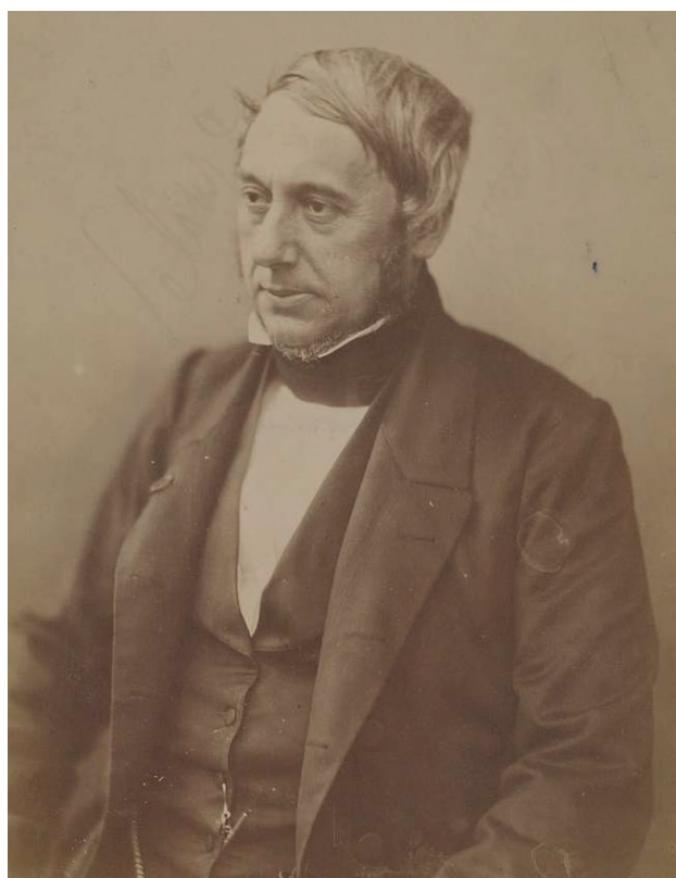
Figure 2. Portrait of Théophile Pelouze.

In 1838, chemist Théophile Pelouze picked up where Braconnot had left off and attempted to create practical uses of these new explosive materials derived from nitrocellulose. Pelouze is most famous for his laboratory, which performed various explosive-based experiments, and eventually included students such as Alfred Nobel. He also held positions at institutions, including Collège de France and Commission des Monnaies ,